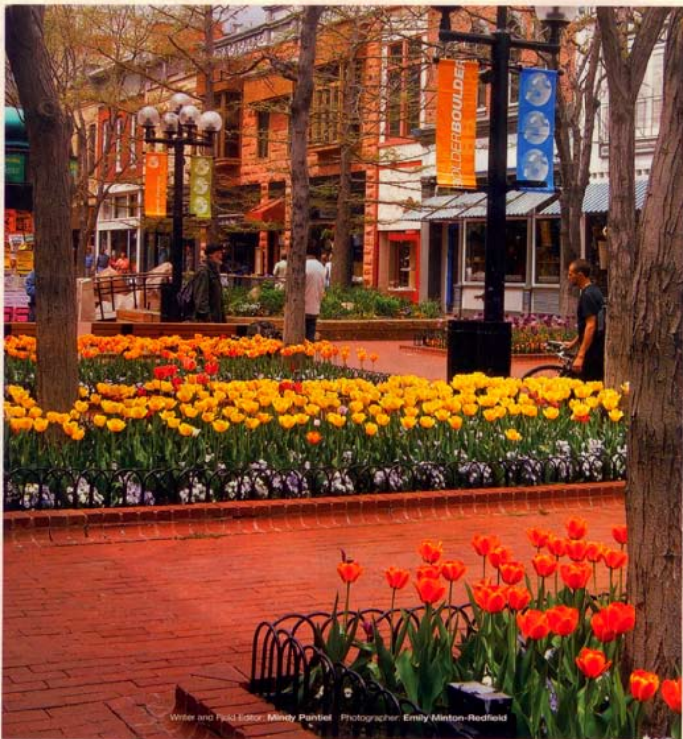
Writer and Field Editor: Mindy Pantel

What began three decades ago as a four-block pedestrian mall now serves as Boulder's social hub, offering more than 170 shops along 12 city blocks.