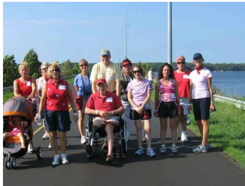
MSLL team at O'Sail's annual Crossing.