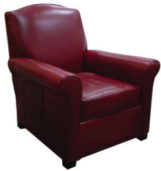
CHANDLER CHAIR In Folsom Red (limited stock) $1,195 | compare at $1,895