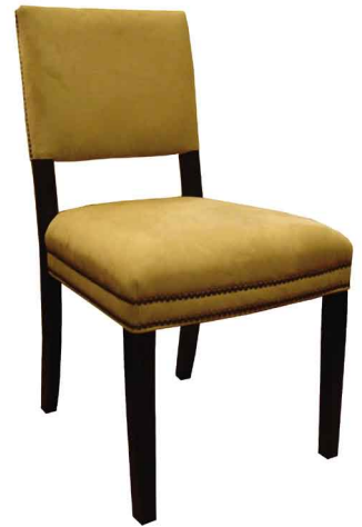
NEWTON DINING CHAIR On Select High Performance Fabrics Shown in Techno Khaki $350 | compare at $690