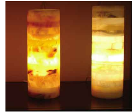
ONYX ACCENT LAMPS 12H 4.5Dia (limited stock) $179 | compare at $289