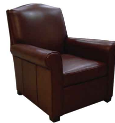
CHANDLER CHAIR In Clovis Chestnut (limited stock) $1,195 | compare at $1,895