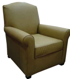
CHANDLER CHAIR In Hollis Sand (limited stock) $1,195 | compare at $1,895