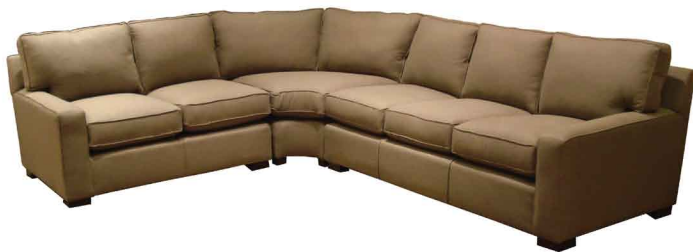
FRANK SECTIONAL | MITCHELL GOLD + BOB WILLIAMS In Graham Gargoyle (limited stock) $2,999 | compare at $5,860