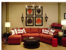
Flatiron Crossing Mall 2000