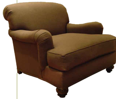
FLETCHER CHAIR In Graham Choc (limited stock) features white goose down seat cushion $999 | compare at $1,770

Ask our Design Consultants about special styles available for immediate delivery. With our local warehouse in Boulder, we have the best White Glove Installation Team at your disposal.