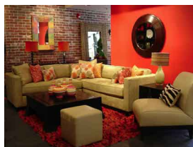
Boulder | Pearl Street East 1999

HW Home. Avoiding the "Phoebe" Syndrome.