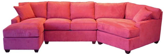
ATLANTA SECTIONAL On Select High Performance Fabrics | Shown in Geosuede Russett $2,999 | compare at $4,350

BOULDER | Pearl Street East | 1941 Pearl Street | Boulder | t 303 545 0320 BROOMFIELD | Flatiron Crossing Mall | t 720 887 1223 DENVER | Cherry Creek North | 199 Clayton Lane | t 303 394 9222 LANDMARK | 5375 Landmark Place | Greenwood Village | t 303 779 9500 FLORAL DESIGN | HW Design | 3060 Sterling Circle | Boulder | t 303 381 1480