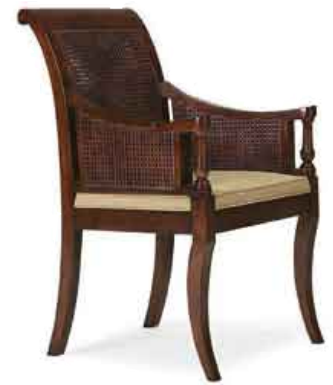
REGENCY CANE CHAIR Creme seat cushion $395 | compare at $825