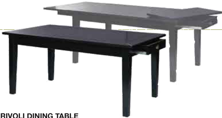
RIVOLI DINING TABLE Features end drawers with two self storing leaves $1,299 | compare at $1,895