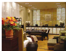
Landmark | Greenwood Village 2007